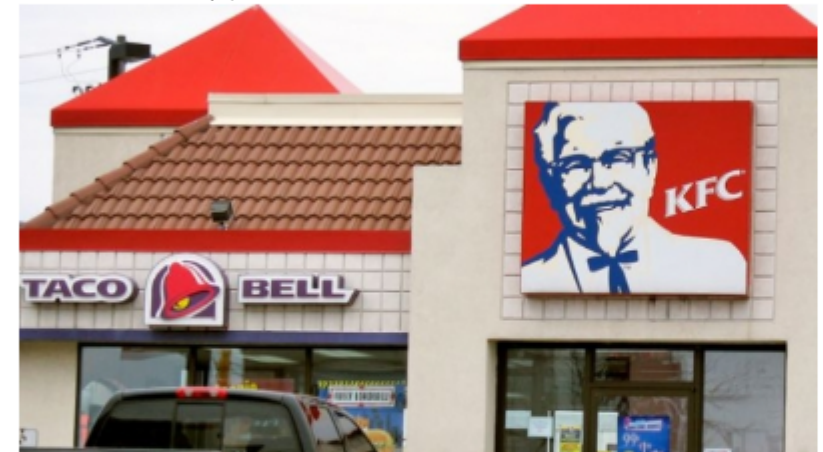
KFC and Taco Bell

Jan 14, 2013 02:40 PM EST | By Isabel Altice